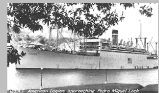
USS American Legion approaching Pedro Miguel Lock USS American Legion attack transport - (APA - 17) - Built October 1919 and decommissioned March 1946

Our numbers continually prove the more involved a Legionnaire is in our organization, the more likely he or she will be to renew membership. "American Legion Basic Training," will go a long way to baiting the hook and building brand loyalty for those with the desire to lead, participate in and